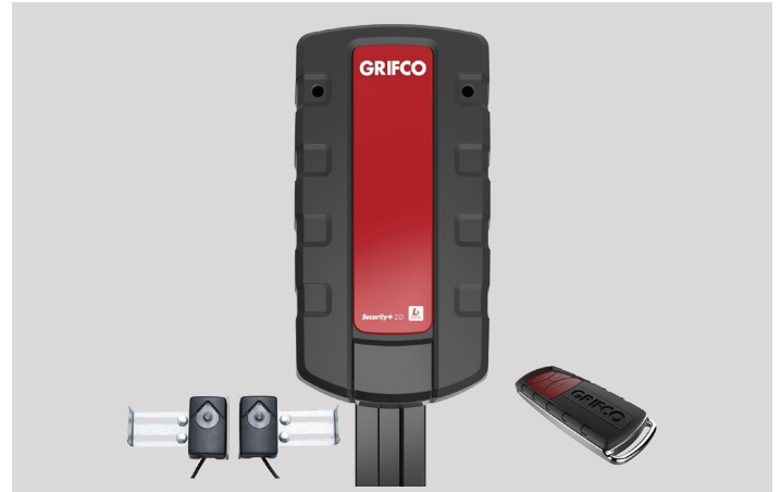
Product may differ slightly from image shown.

Controller upgrade separately available. Please refer to the relevant Specification Sheet for details.