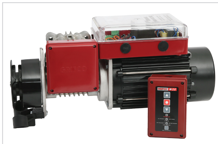
Product may differ slightly from image shown.