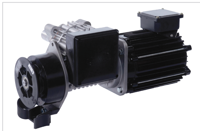
Product may differ slightly from image shown.