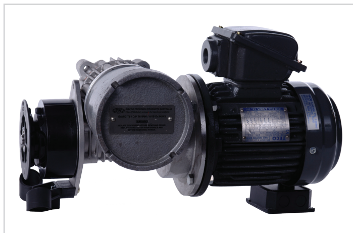
Product may differ slightly from image shown.