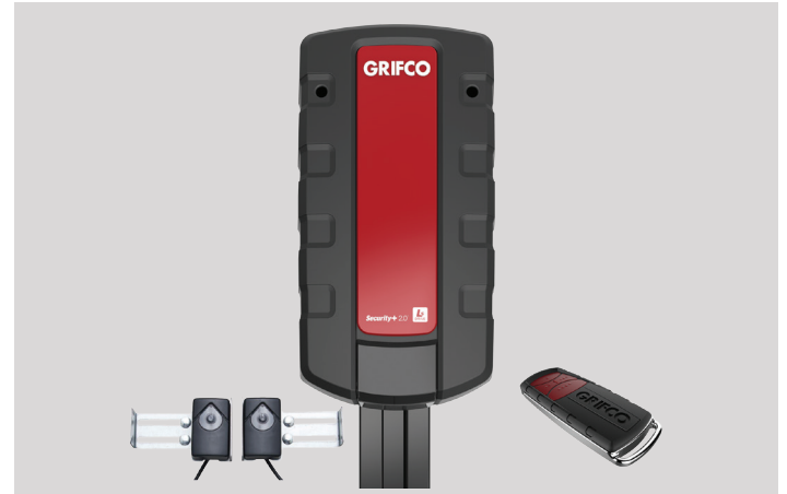
Product may differ slightly from image shown.

LS-Drive Operator, Rail for door max 3.0m high, 774ANZ Safety Beam, E960G 4-Channel Transmitter, Installation Hardware