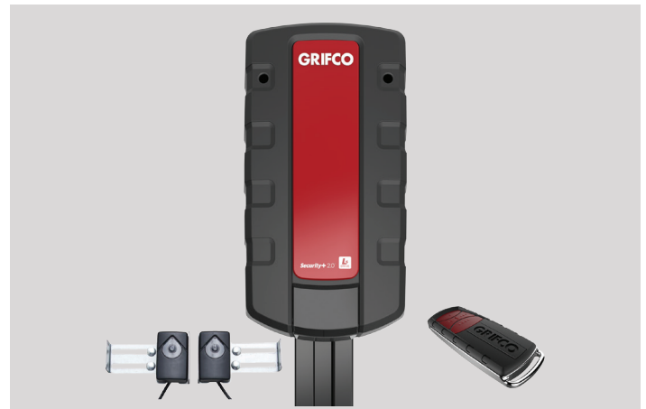
Product may differ slightly from image shown.

Controller upgrade separately available. Please refer to the relevant Specification Sheet for details.