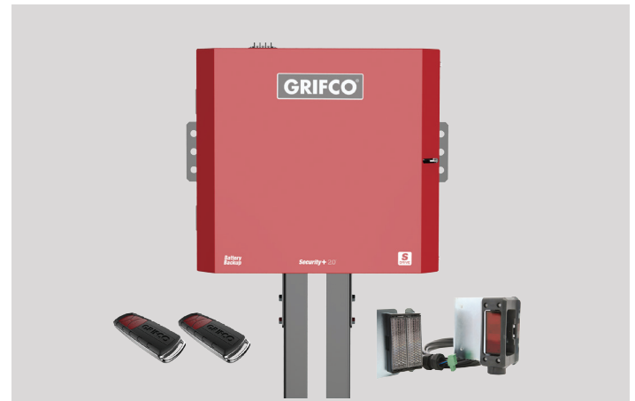
Product may differ slightly from image shown.

Commercial Door Operators / Sectional Door Operator / S-Drive