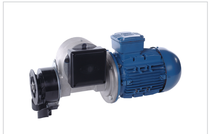
Product may differ slightly from image shown.